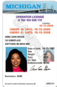
Under 21—Vertical License